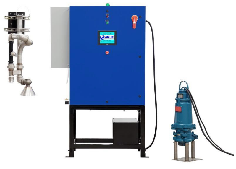
* Hose & Fittings Not Shown